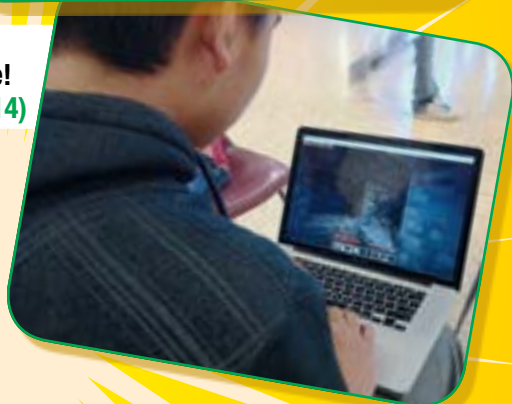
Rocket Science & Astronomy grades 4-8 (p.17)