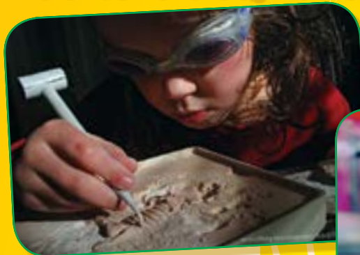
Dinosaurs: Monsters From The Past grades 1-4 (p.16)