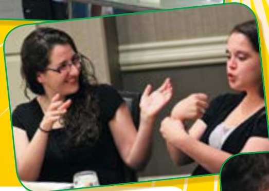
American Sign Language (ASL) grades 5-12 (p.13)