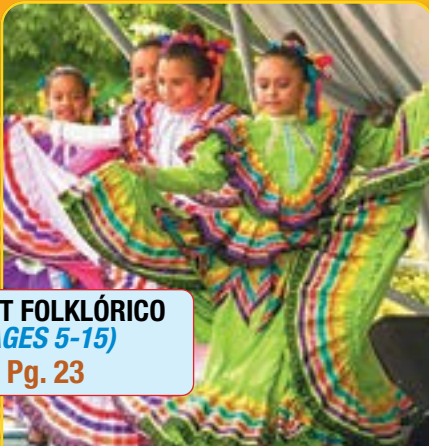
BALLET FOLKLÓRICO (AGES 5-15)