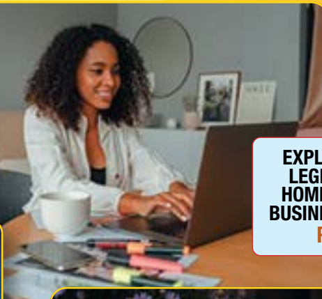
EXPLORE 250 LEGITIMATE HOME-BASED BUSINESS IDEAS