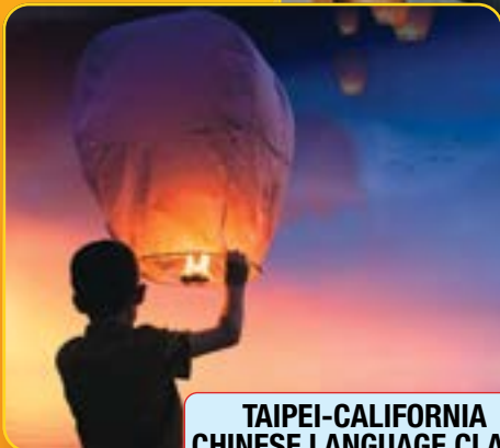
TAIPEI-CALIFORNIA CHINESE LANGUAGE CLASS