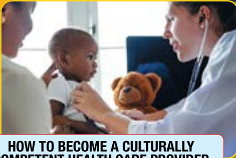
HOW TO BECOME A CULTURALLY COMPETENT HEALTH CARE PROVIDER