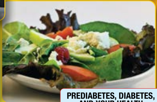
PREDIABETES, DIABETES, AND YOUR HEALTH