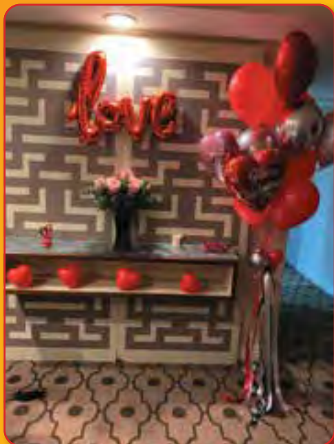
VALENTINE BALLOON DÉCOR AND MORE